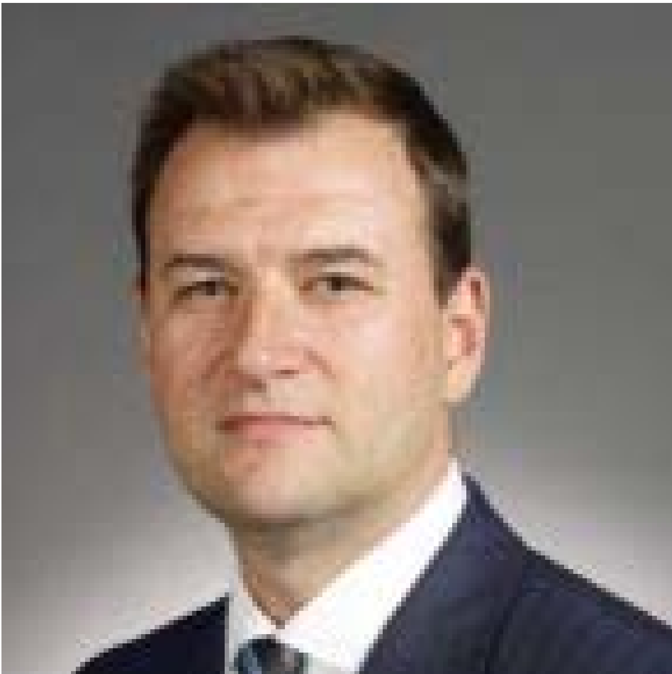
HarbourVest: Charting The Uncharted